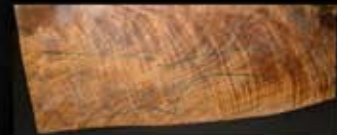
Dble Feather Crotch