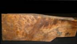
Turkish Burl Birdseye